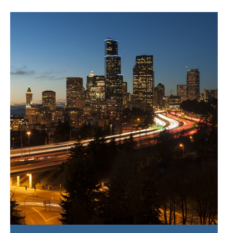
Washington passed legislation aimed specifically at reducing VMT, but agency responsibility is unclear and results have yet to be seen. County plans must meet state goals, but counties have the ultimate say in how they plan to reduce VMT.

to engage in economic transactions on their commutes, and benefits to overall transportation system efficiency as fewer cars fill our roadways. Provisions for social equity, such as inclusionary zoning regulations and accessible transit networks, also must be part of land use and transportation plans aimed at VMT reduction. Perhaps most important, states need reliable sources of funding for multimodal transportation infrastructure and development that prevent reliance on automobiles. These and other findings from each of the four states' plans to reduce VMT will be submitted for publication in academic journals, as well as made available as a policy brief, this summer and fall.