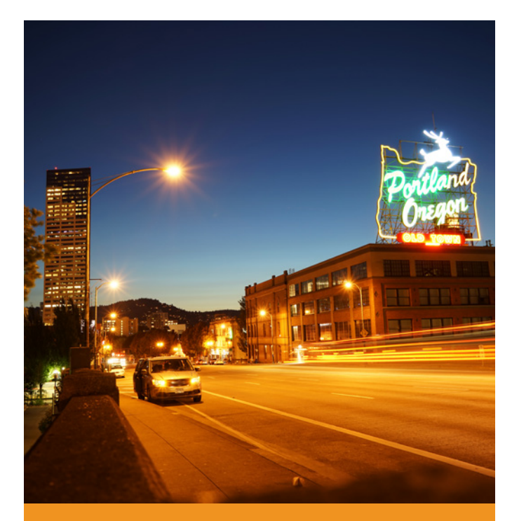
Oregon's legislature passed greenhouse gas reduction goals, but mandatory reductions from light duty vehicles are only imposed on the Portland metropolitan region, governed by Metro regional government. Metro developed the "Climate Smart Strategy" that, if properly funded, will reduce emissions from automobiles by 20 percent by 2035.