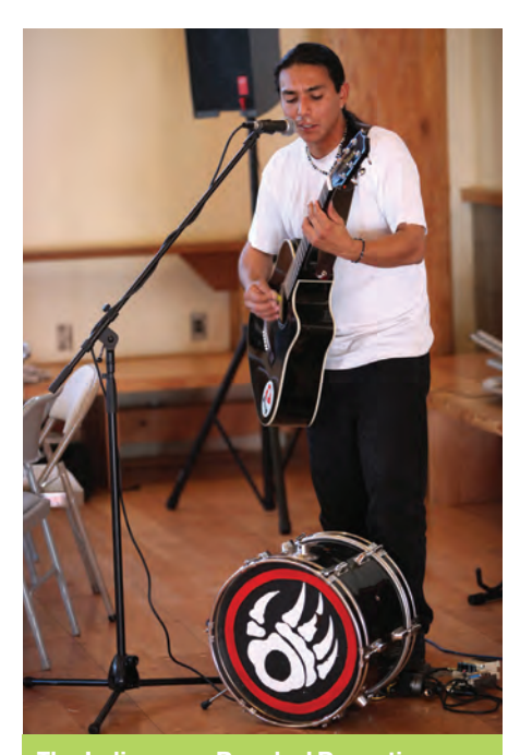
The Indigenous Peoples' Reception, organized by NESP fellows each year, was held on February 26 at the Many Nations Longhouse with music by Good Shield.

The 2009 NWWLS, organized in part by OCWP fellows and other UO law students, was nominated for the Law Student Program of the Year by the ABA's Section of Environment, Energy, and Resources.