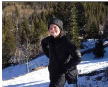
Kerry Rydberg Award for Environmental Activism