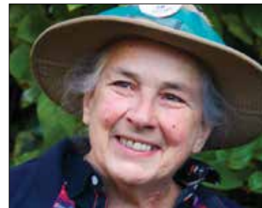
David Brower Lifetime Achievement Award