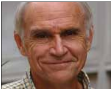
Svitlana Kravchenko Environmental Rights Award

Each year, Land, Air, Water (LAW) students recognize outstanding environmental activists at the Public Interest Environmental Law Conference through the following awards