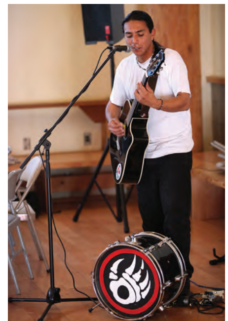
The Indigenous Peoples' Reception, organized by NESP fellows each year, was held on February 26 at the Many Nations Longhouse with music by Good Shield.

The 2009 NWWLS, organized in part by OCWP fellows and other UO law students, was nominated for the Law Student Program of the Year by the ABA's Section of Environment, Energy, and Resources.