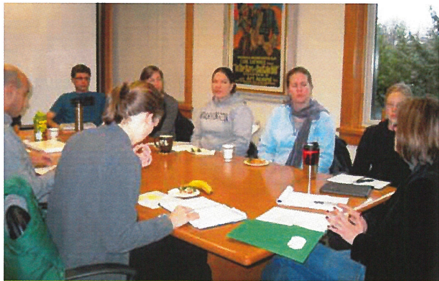
2009–10 fellows for the ENR Program