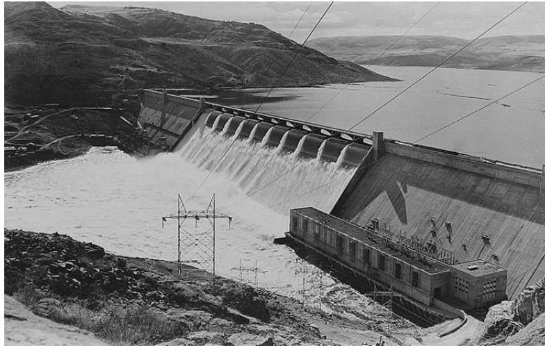
Figure 1: Grand Coulee Dam 1

The advent of the turbine created a landscape where we could develop a significant source of power in the United States that was, and is, touted as a clean, green, low-carbon footprint source of energy. Today, as was the case even at the time that hydropower was gaining prominence, we disagree about whether and to what extent hydropower is clean, whether it is green, and about its carbon footprint. Despite these debates, it is hard to discount the comparative advantages of hydropower in terms of its carbon footprint versus other forms of energy, particularly coal. Understanding hydropower's